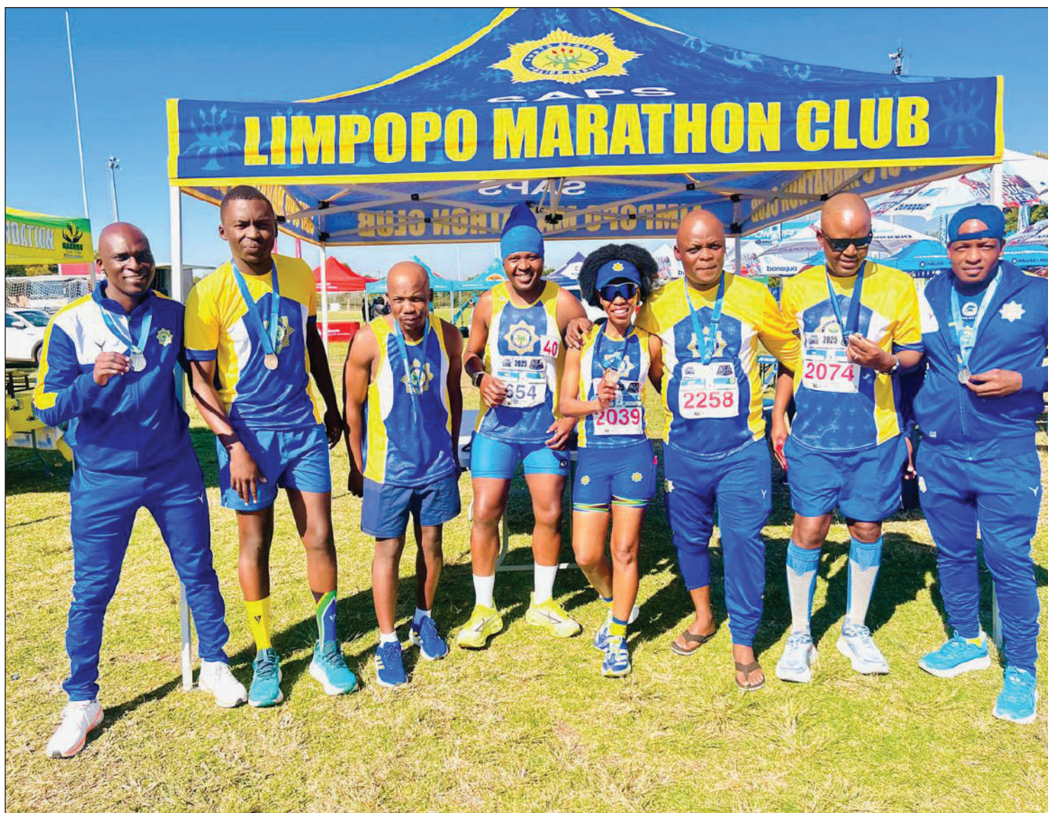
The Limpopo Police Marathon Club members took part in separate athletics competitions across Limpopo Province.