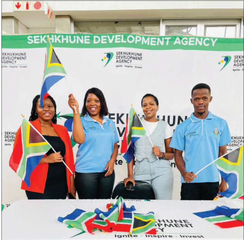
The ANC in Sekhukhune Region has confirmed that the SDA will be revitalized, rubbing rumours of the agency’s possible dissolutions.