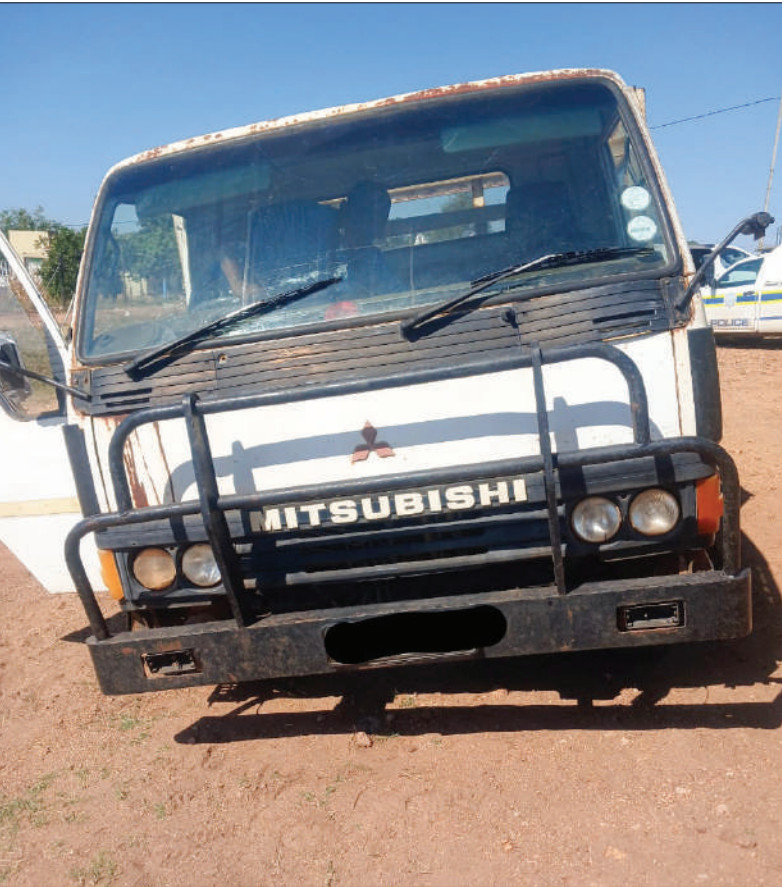
The Mitsubishi truck that was recovered by the police during illegal sand mining activities.