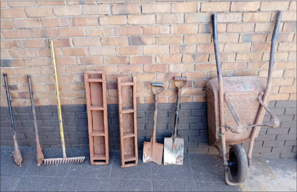
The recovered illegal sand mining equipment which was confiscated by the police during Operation Vala Umgodi.