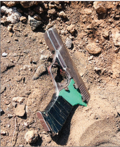
An unlicensed firearm was recovered by the police during the high-density Operation Shanela. packets of illicit tobacco products, 2989kg of dagga, a firearm and seven cellphones,” explained Ledwaba. The Provincial Commissioner of the Police in Limpopo, Lieutenant General Thembi Hadebe, welcomed the results achieved, urged police members to remain consistent and dedicated to ensure the safety and security of all citizens in the province.

LIMOPOPO Operation Shanela, the weekly multidisciplinary high-density operation that commenced on Monday 5 May to Sunday 11 May 2025, at all five districts in Limpopo Province, resulted in 629 suspects being apprehended. The operation involved various police activities such as vehicle checkpoints (VCPs), stop and search, compliance inspections, tracing of wanted suspects, and hostel searches. Colonel Malesela Ledwaba, Limpopo Provincial Police Spokesperson, said during roadblocks, 7363 vehicles were stopped and 5516 persons were stopped and searched. “A total of 758 licensed liquor premises were inspected and another 5401 informal businesses were inspected,” he said. Ledwaba indicated that the operational successes achieved included 629 suspects arrested for possession of dangerous weapons, illegal dealing in liquor, dealing in drugs, assault GBH, common assault, illicit mining, and driving under the influence of alcohol. “The police confiscated 396,272 litres of alcoholic beverages, 13 ammunitions, 169