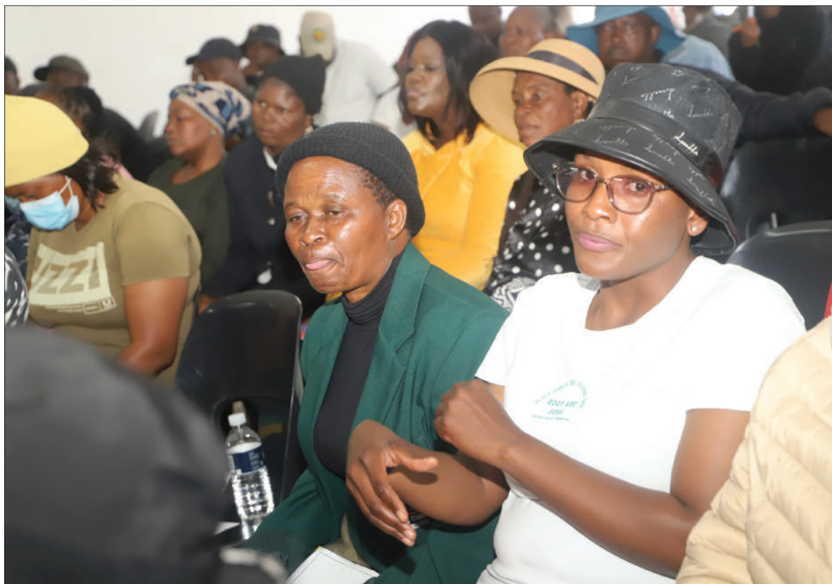
Community members thanked the Executive Mayor of the District.