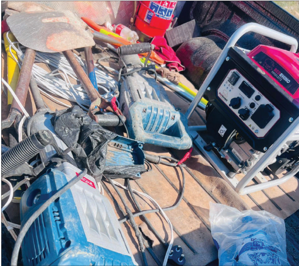
Two generators, 2 jack hammers, two shovels and an electric cable were seized by the police during Operation Vala Umgodi.