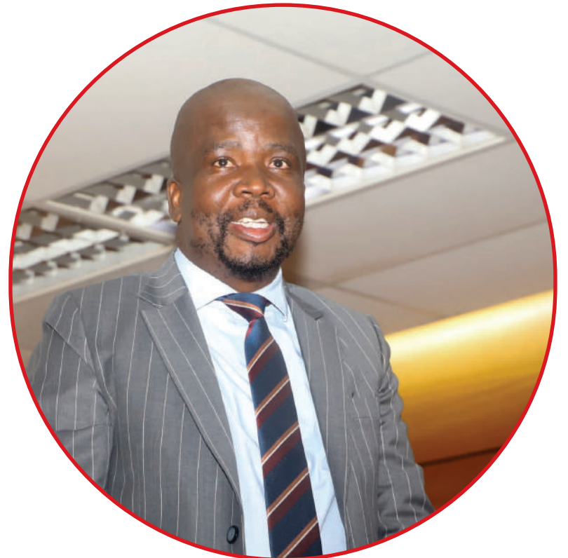
Mayor Eddie Maila during the launch of satellite office at Ga Nkoana